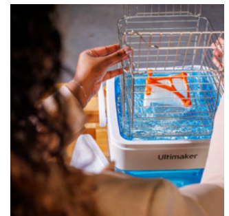
PVA Removal Station Remove water-soluble PVA support material up to 4X faster