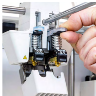
Print core BB Quick-swap nozzles for build and water-soluble support materials. Available in 0.25, 0.4, and 0.8 mm