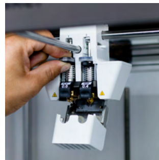
Print core CC Ruby-tipped for printing abrasive glass and carbon fiber composites. Available in 0.4 and 0.6 mm