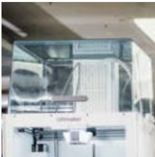
Air Manager EPA filter removes up to 95% of UFPs