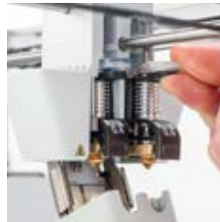
Print cores AA and BB Quick-swap nozzles for build and water-soluble support materials