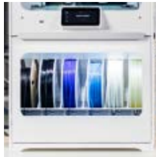
Material Station Simplify and automate material handling