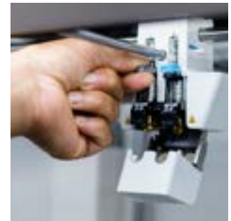
Print core CC Ruby-tipped for printing abrasive composites