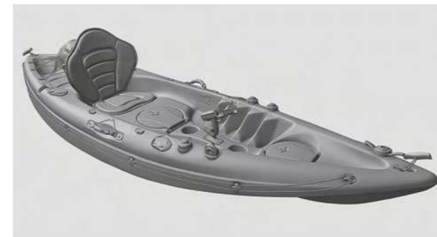
| Turbines, ship propellers, small boats