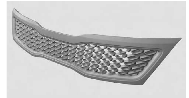
| Automotive parts