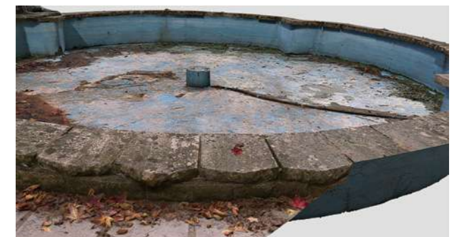
| Crime scenes