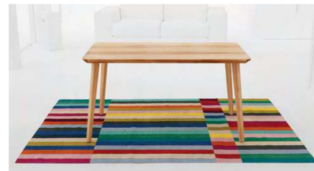
| Furniture and room interiors