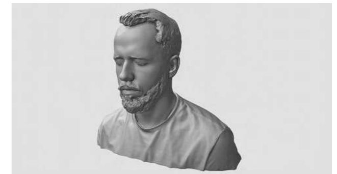
| Statues, and the human body